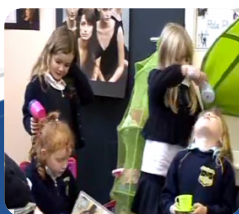
Having your hair done

We need the help of parents and carers to cut down on this these kind of absences: