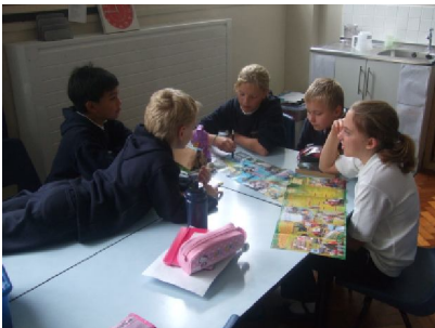
Working on the promotional leaflet.

Some completed fairground rides and a proud design team.